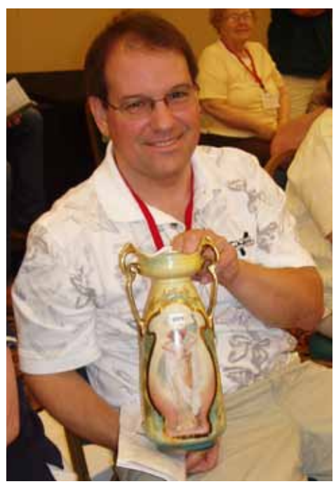
13" Prov Saxe Two Handled Vase — Yellow and green tones, Woman and Peacock scenic decor, gold stencil highlights $600