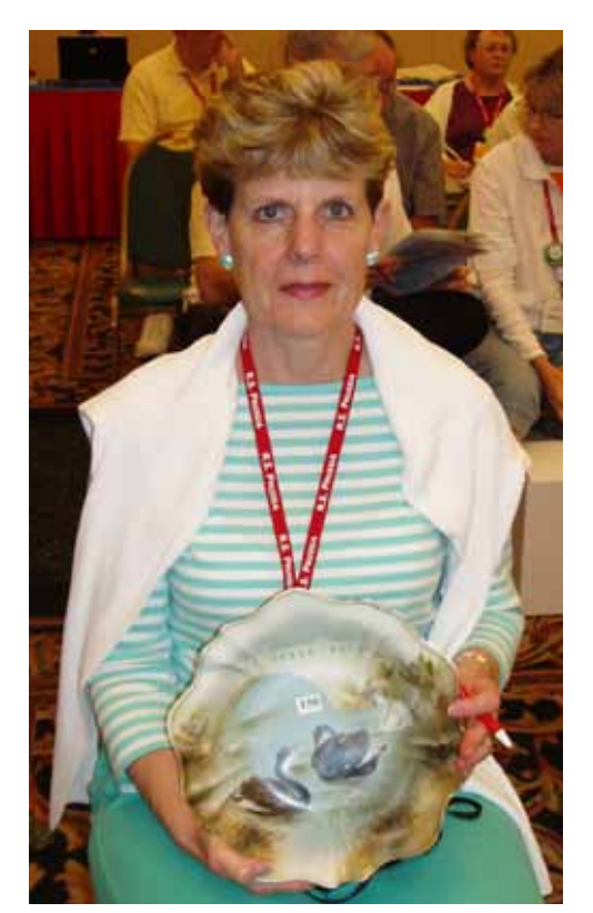
Rare 10 1/2" Unmarked Prussia Bowl — Black Swan near white bridge scenic decor $1500