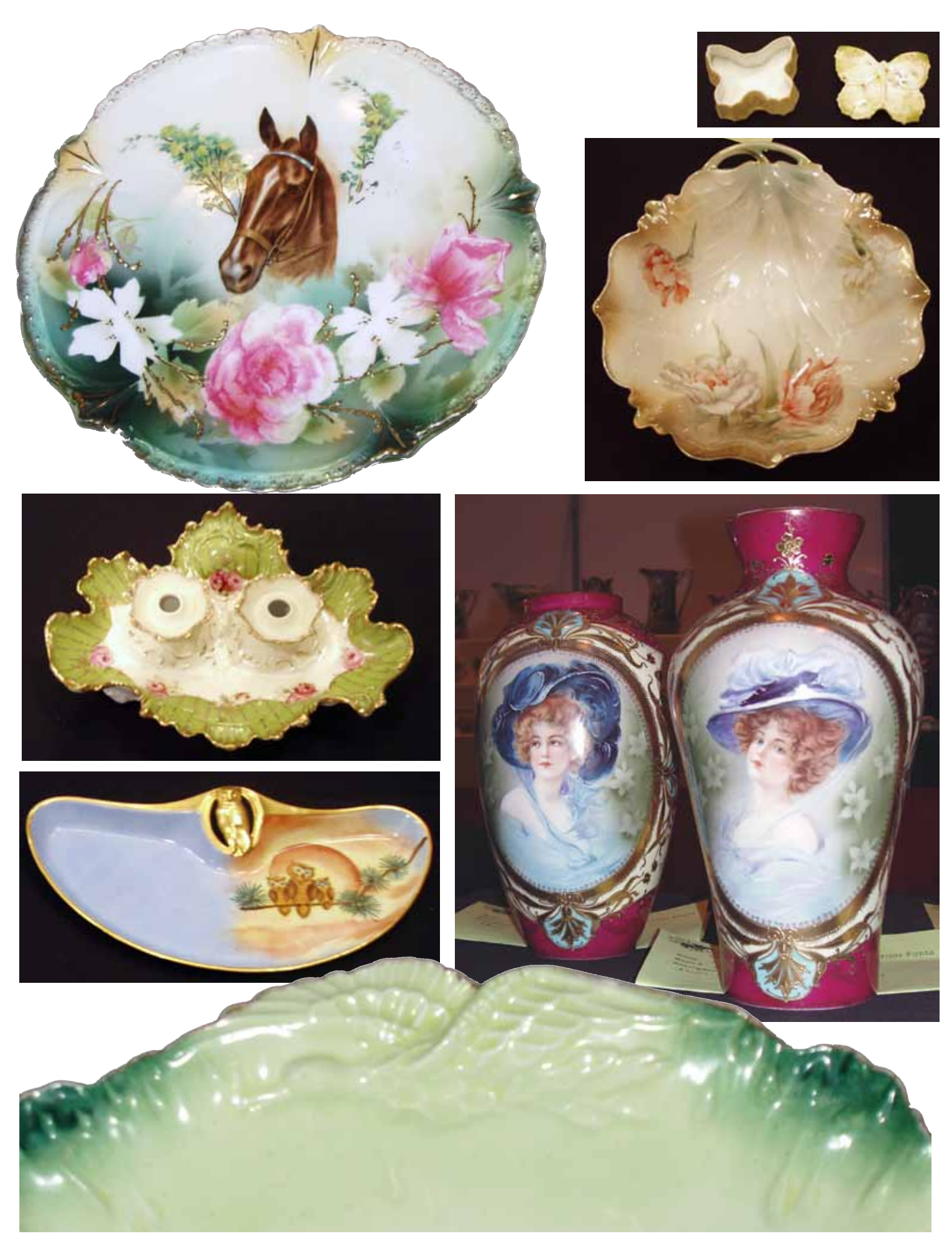
The Newsletter of the International Association of R.S. Prussia Collectors, Inc. \mid October 2009 \mid 7