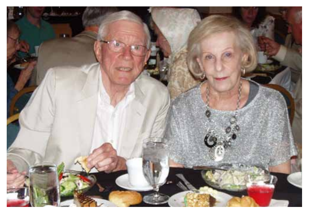
Saturday, July 24, 2009