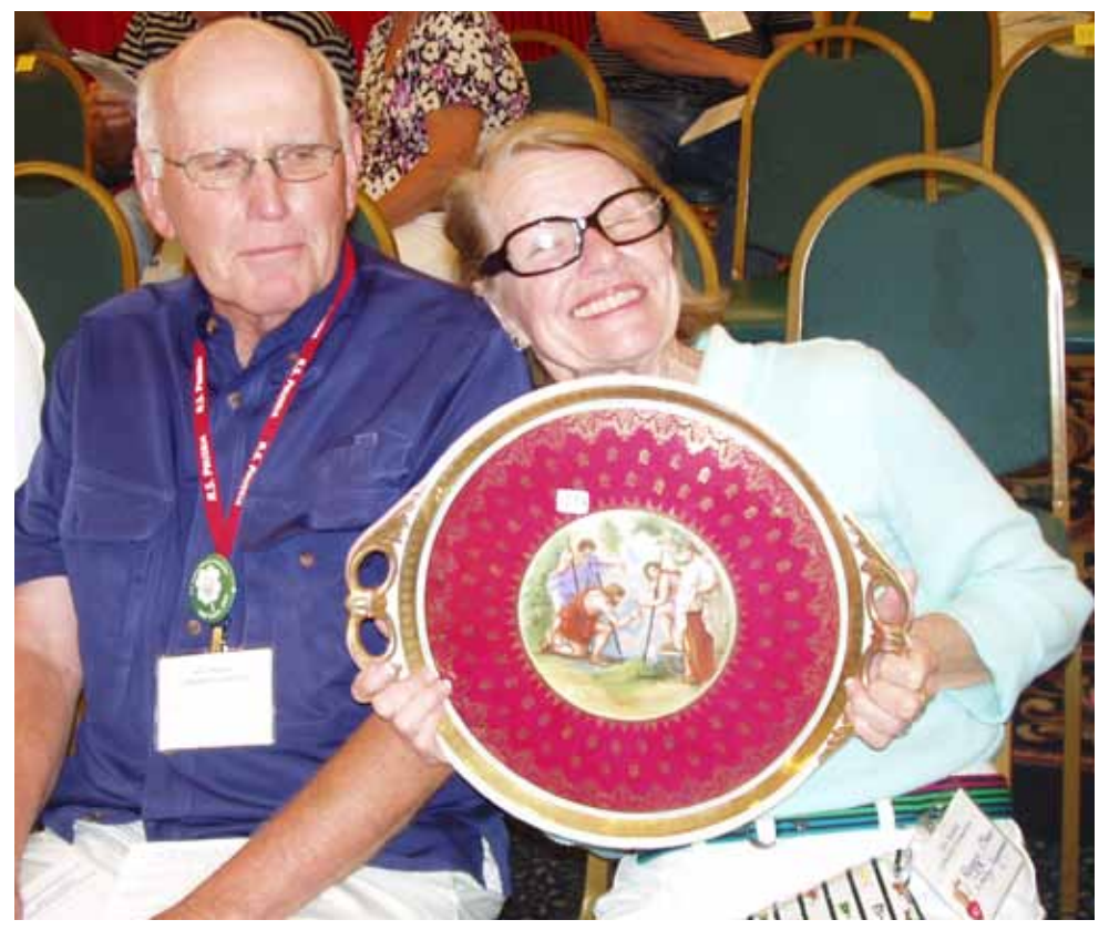
16 1/2" Victorian Austria Handles Service Tray — Dark red background with heavy trim and stencil highlights, classical scene $75