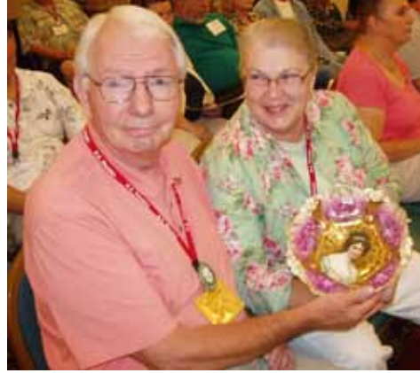
10 ½" Unmarked Prussia Lily Mold Footed Bowl — Heavy gold center background with Lebrun I portrait, dark pink border, gold stencil highlights $1000