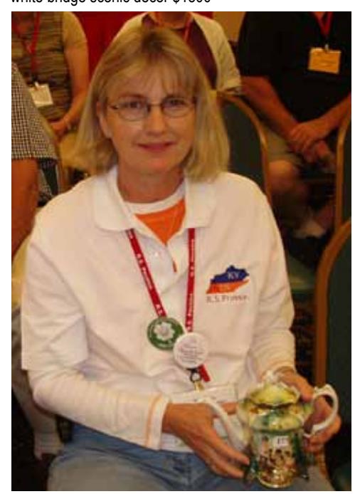
Rare RSP Clover and Jewel Mold Teapot, "Dice Thrower' Scenic Décor. $900