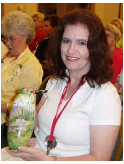
9 1/2" RSP Mold 937 Two Handled Vase — Sheepherder scenic decor $350